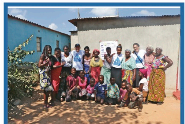
Wish for WASH team collecting user feedback