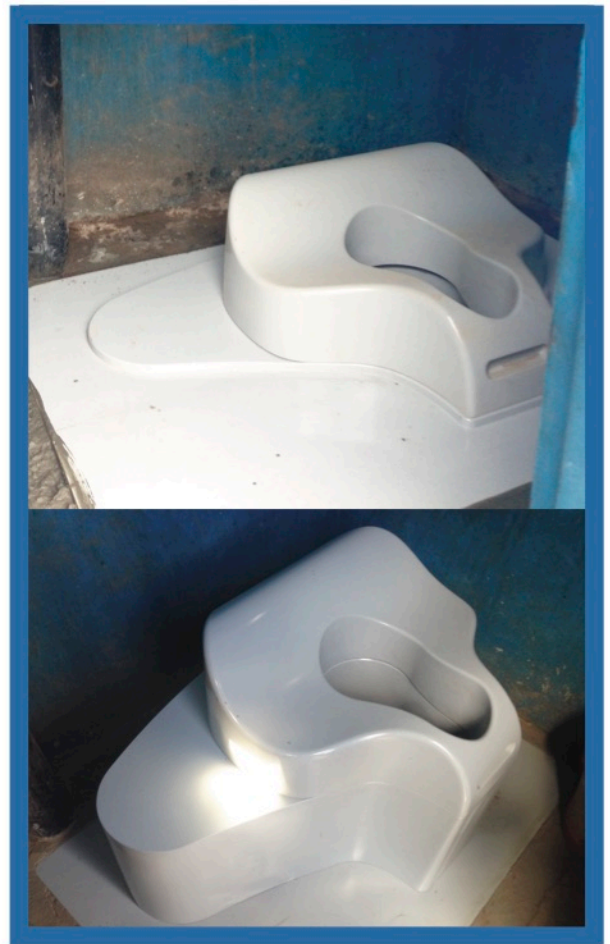
Safichoo 2.0 modular toilet field testing in sit and squat postures

Wish for WASH hopes to receive approval to continue working with WSUP and under the auspices of LWSC to begin scaling a packaged toilet and waste management service to other community members within the Chipata, Kanyama, and Chaisa compounds beginning in mid-2018. Wish for WASH will plan to secure funding to retrofit these 240 EcoSan toilets utilizing a similar approach as this year’s collaborative pilot contingent on project approval from WSUP and LWSC. Wish for WASH plans to also secure funds in order to have a larger SafiChoo toilet manufacturing run to enable the SafiChoo to enter the market at a subsidized price that is comparable with existing toilets on the market in an effort to examine the new product’s market value in tandem with its potential health impact.